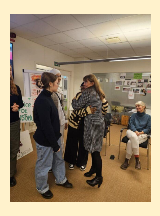
Light manifestation in