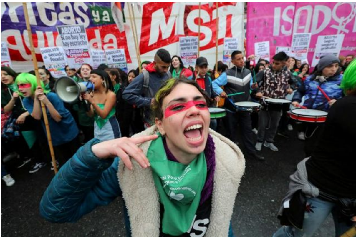
Abortion right activists demonstrating in Buenos Aires

-This will continue during 2019, especially since the women's convention turns 40!